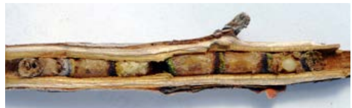
Fig. 3. Nest with cocoons of the bee Hoplitis sambuci excavated in the pith of a dead sumac twig.

Utah is home to about 1,000 named species of native bees, with several hundred species living in any one valley and adjacent montane habitats. Urbanization takes its toll on native bees, but many species can persist with a little help from gardeners and landscapers. Like birds, bees have two primary needs in life: Food (for a bee, pollen and nectar) to feed themselves and their offspring, and a suitable place to nest. An earlier fact sheet ( Gardening for Native Bees in Utah and Beyond ) offers a rich tapestry of garden flowers that provide bees with nectar and/or pollen. We know far less about accommodating the nesting needs of our native bees, but there are certain practices that favor or disfavor their nesting.