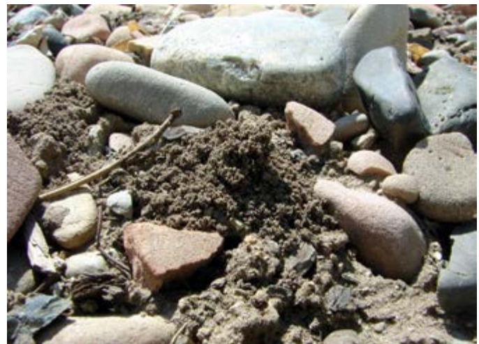
Fig. 2. Nest tumulus (soil heap) thrown up by the bee Halictus rubicundus nesting amid a decorative pebble mulch.