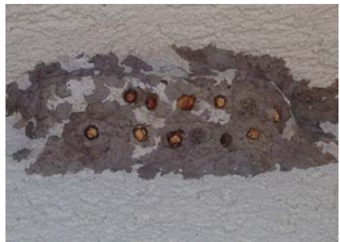
Fig. 4. Leafcutter bee cells in a mud nest built by dirt dauber wasps (photo courtesy of Diane G. Alston, Utah State University).